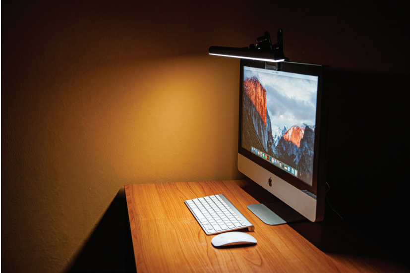
Asymmetric beam for wall washing